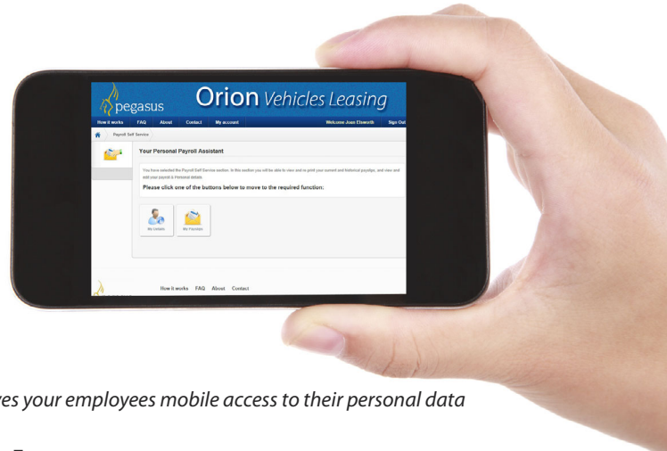
Gives your employees mobile access to their personal data

Online payslips will be available for the employee to access as soon as the Payslips routine has been performed. Employees can view current and previous payslips and print as required; eliminating postage and print costs, and saving time. Printed payslips can still be produced for those employees that do not use the Payroll Self Service.