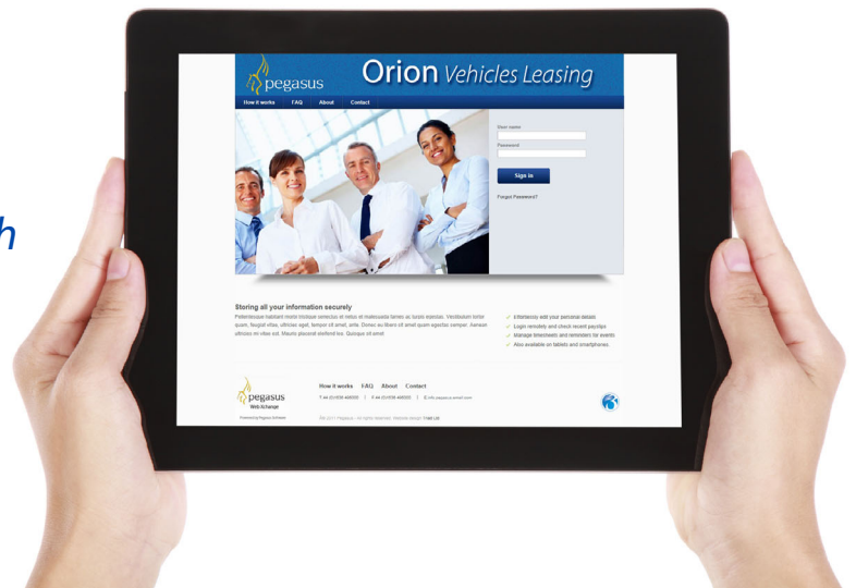
Secure access wherever you are