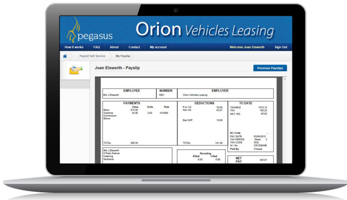
Employees have instant, secure access to their payslips

Please note: This is pre-release information and is subject to change on release.